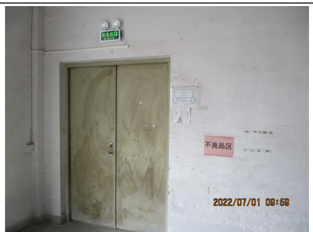
Emergency light and exit sign