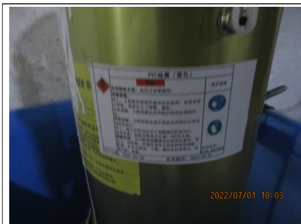
Chemicals with safety label