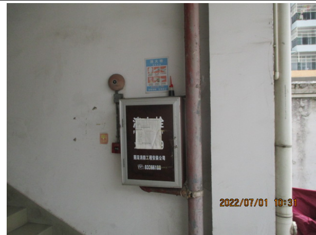
Fire-fighting facilities in dormitory