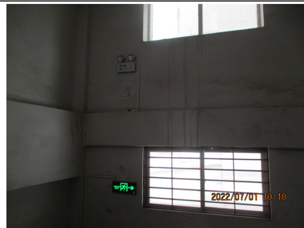
Emergency light and exit sign along the stairs