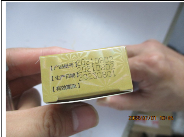
The medicine is within its expiry date