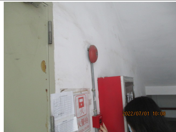
Fire alarm testing