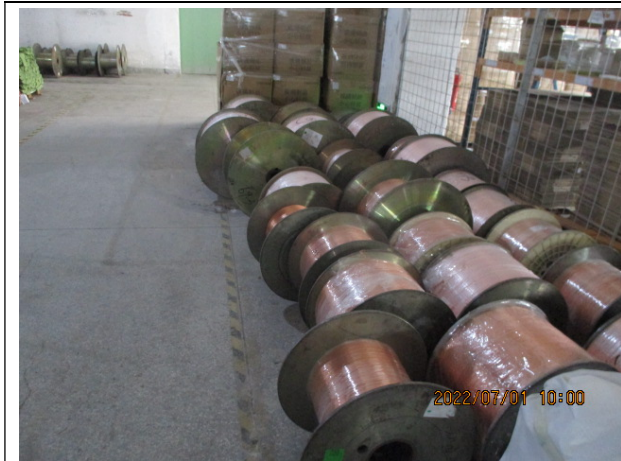
Raw materials warehouse