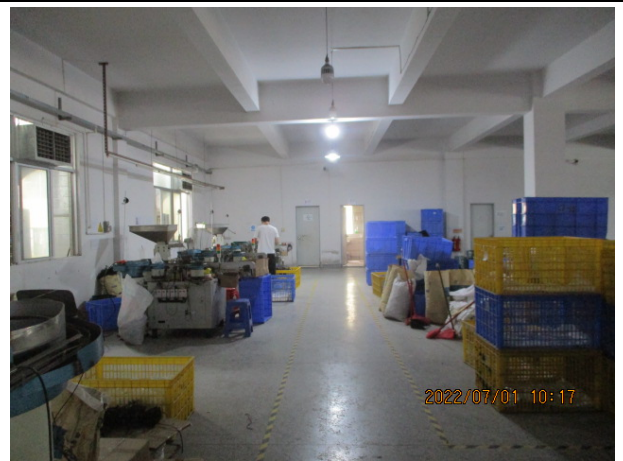
Terminal making and Holder Pressing