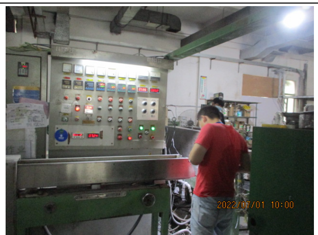
NC: Worker didn't wear earplugs