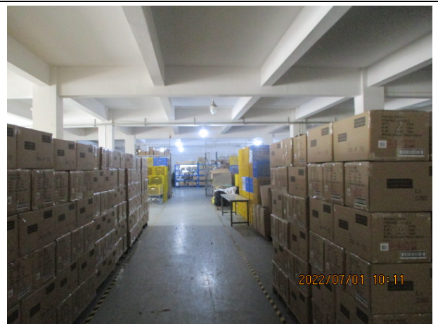
Finished products storage