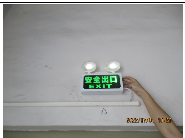
Emergency light test