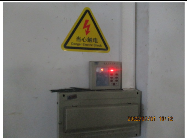
Electrical box with warning sign