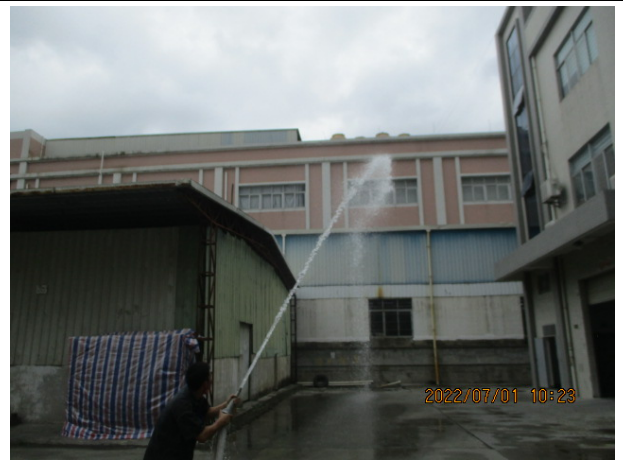
Fire hydrant testing