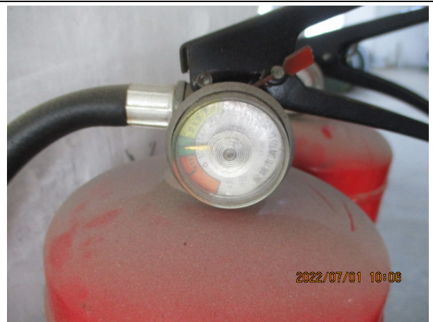
Fire extinguishers in good condition