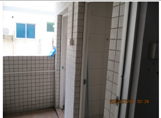
Toilet and bathroom in dormitory