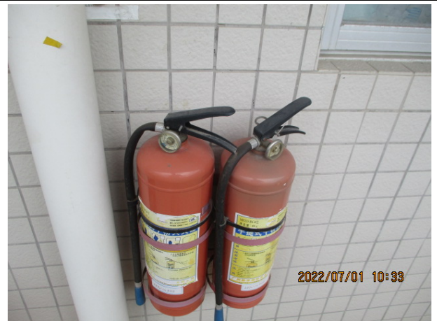
Fire-extinguishers in dormitory