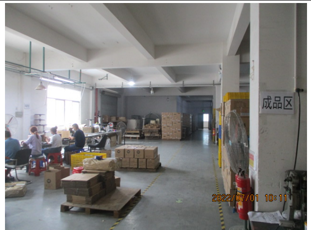
Assembly and packing