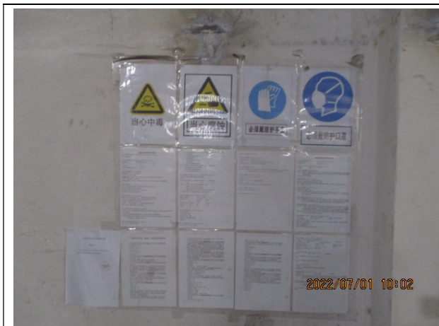
PPE notice sign and MSDS onsite