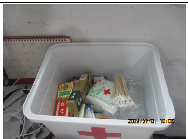
First aid kit