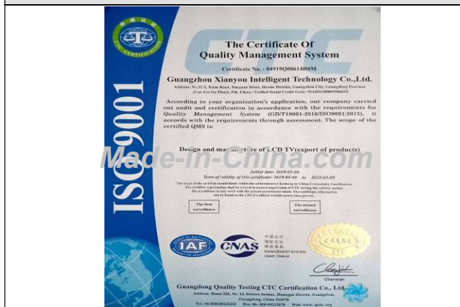
Description: ISO9001 Certificate