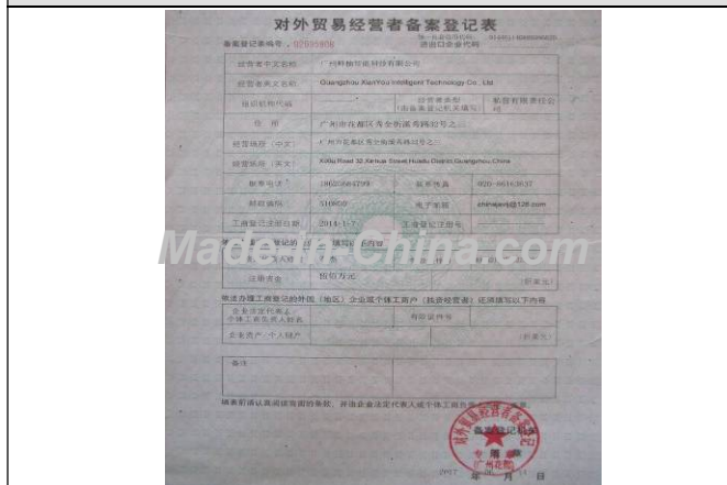
Description: Export License