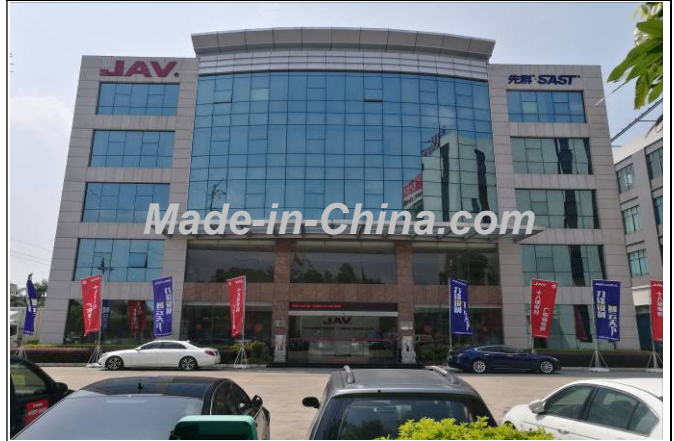
Description: Office Building