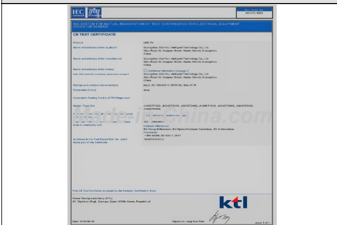
Description: CB Certificate