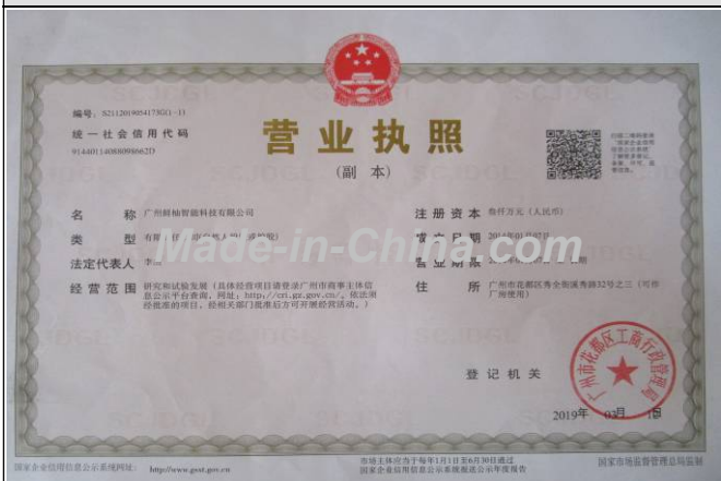
Description: Business License