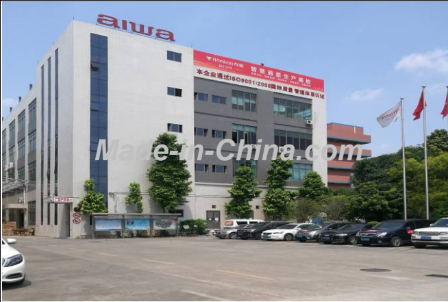
Description: Workshop Building