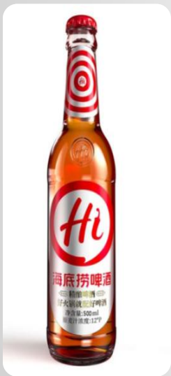
Hai Di Lao