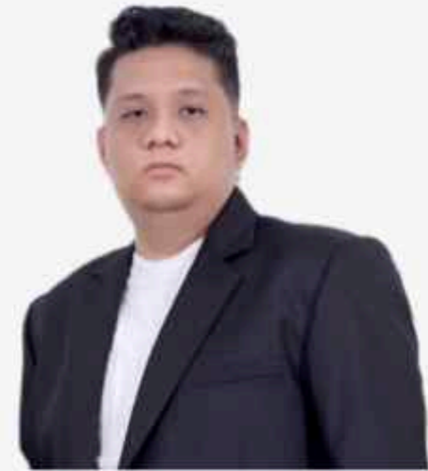
M. Ilham Chief Executive Officer

Indotesa Sriwijaya is expected to be "King of Coconut Supplier", with apply two strategies to achieve it. First is to strengthen cooperative relationships with local and international customers, and second is to implement a commitment to reliable work quality and superior products.