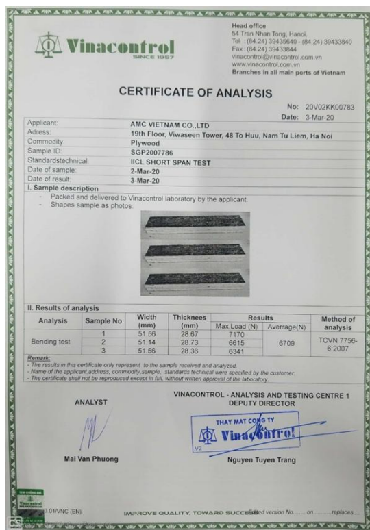
Technical Specifications of Container Flooring Plywood of AMC Vietnam