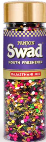
Rajasthani Mix 150 gm