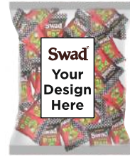
100 gm Plain Pouch