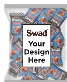
200 gm Pouch