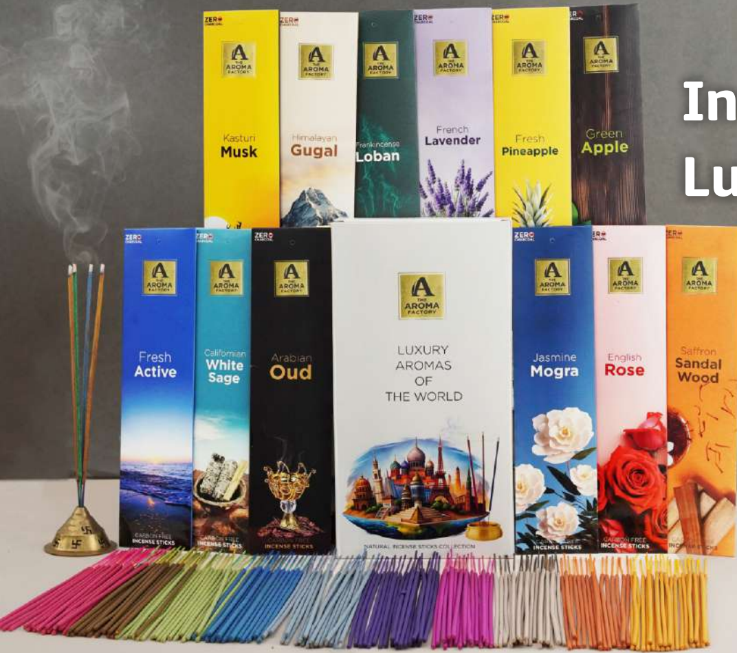
Frankincense Loban Californian White Sage French Lavender Fresh Active Himalayan Gugal