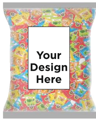
100 g Plain Pouch