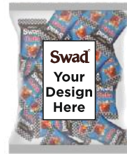
100 gm Plain Pouch