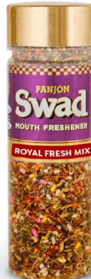
Royal Fresh Mix 120 gm