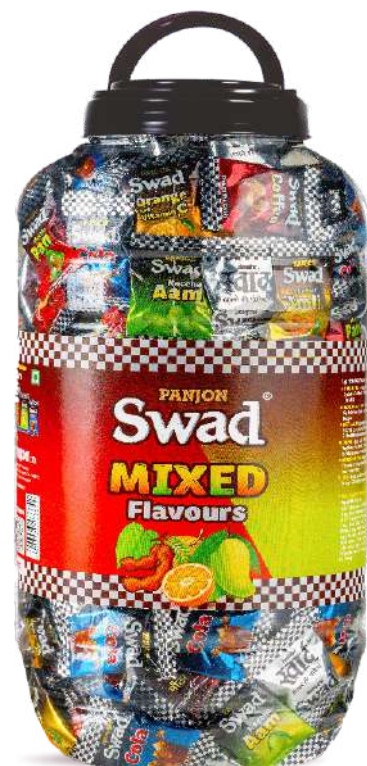
2.5 Kg Jar