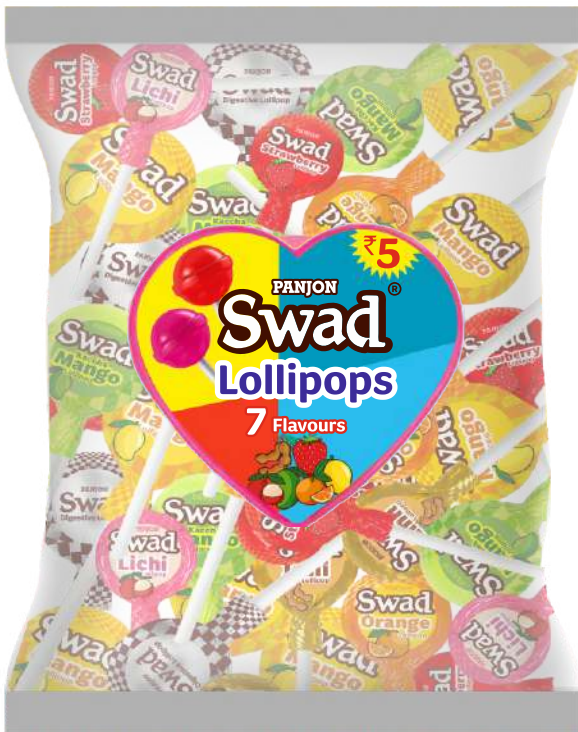
Mixed Lollipop Pouch 63 Pcs x 11 gm = 693 gm

Lollipops with the highest quality 7 fruit flavours - Strawberry, Lichi, Mango, Tamarind, Masala, Orange, Raw Mango