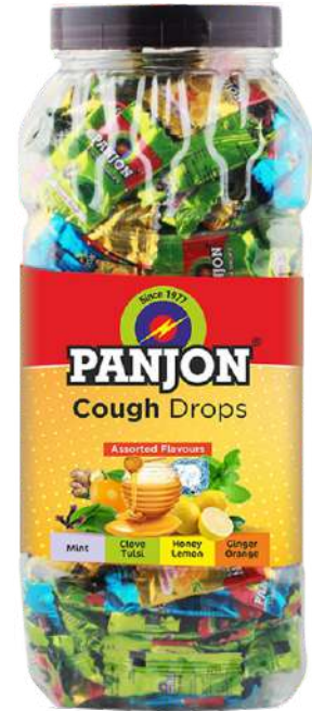
500 g Jar

Panjon Balm made with ayurvedic oils, for instant relief from Body Pain, Headache, Cough & Cold