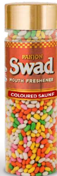
Coloured Saunf 180 gm