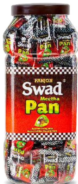
500 gm Jar