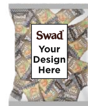
100 gm Plain Pouch