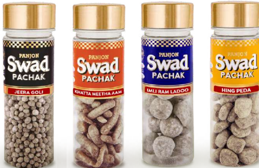
Jeera Goli 140 gm