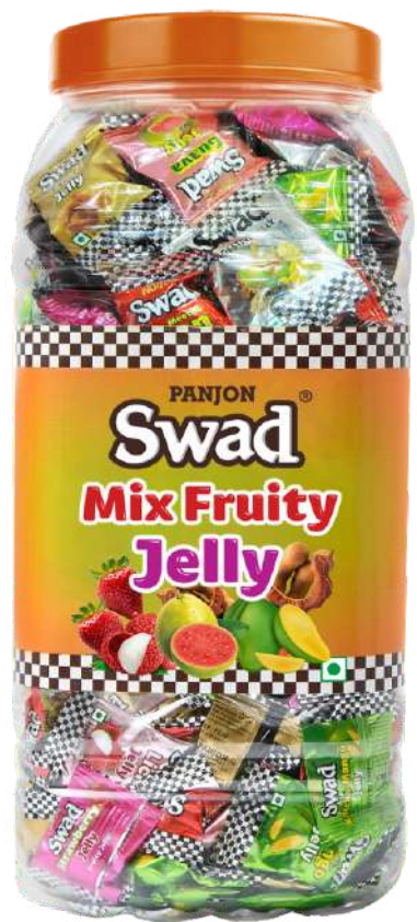
500 gm Jar