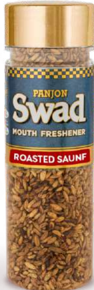
Roasted Saunf 60 gm