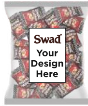
100 gm Plain Pouch