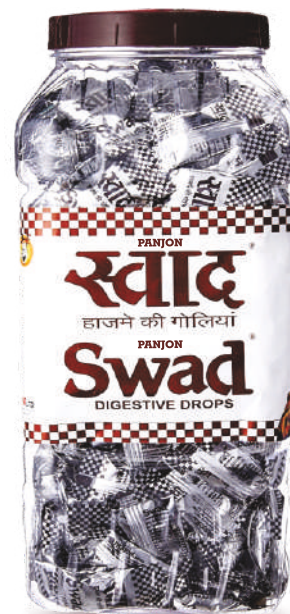
500 gm Jar