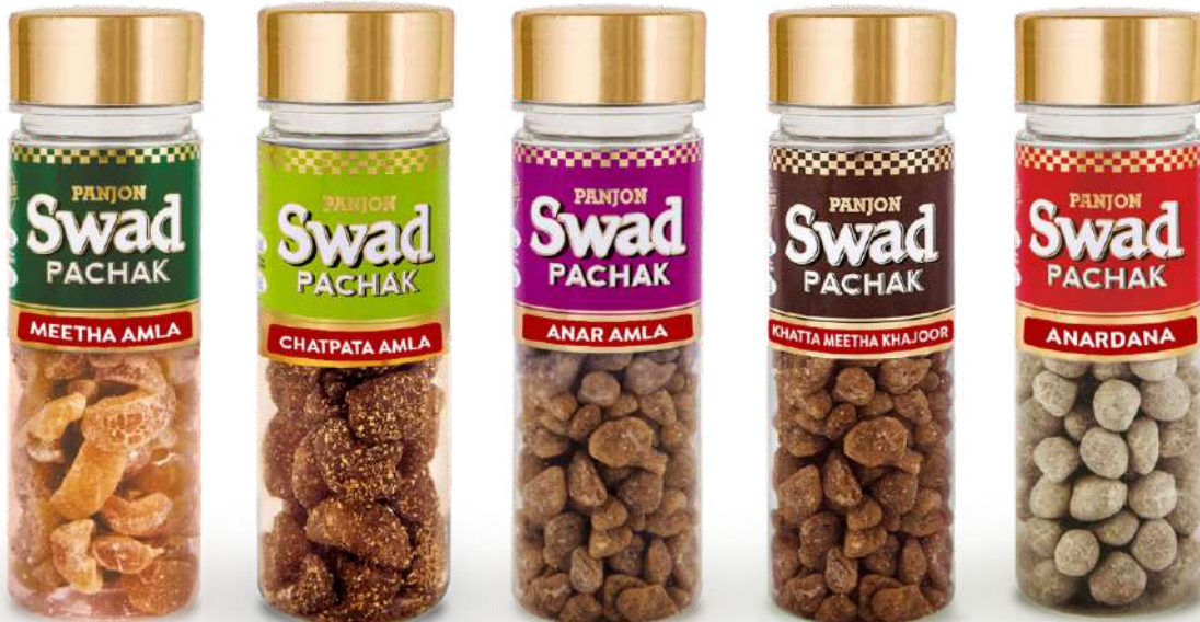
Meetha Amla 115 gm

Premium Range of Fruit based Pachak Mouth Fresheners for Fruity Freshness after meals.