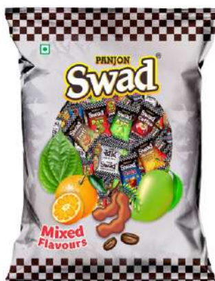
200 gm Pouch