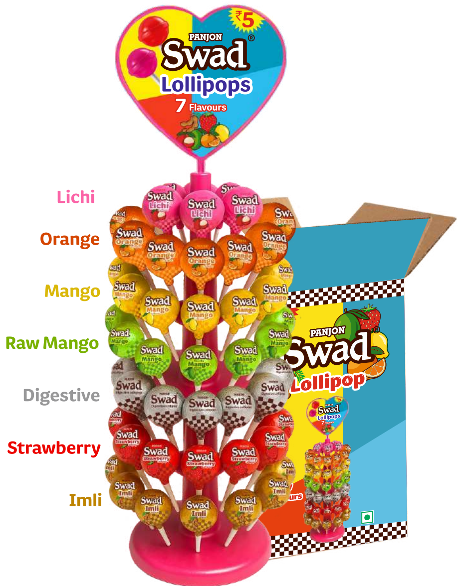
Lollipop Mix Tree Box 84 Pcs x 11 gm = 924 gm