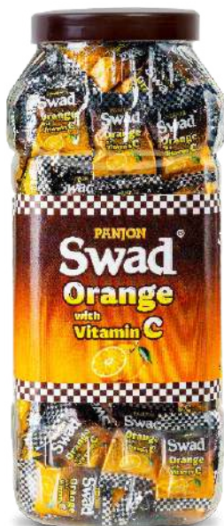
500 gm Jar