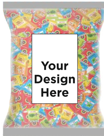
200 g Plain Pouch