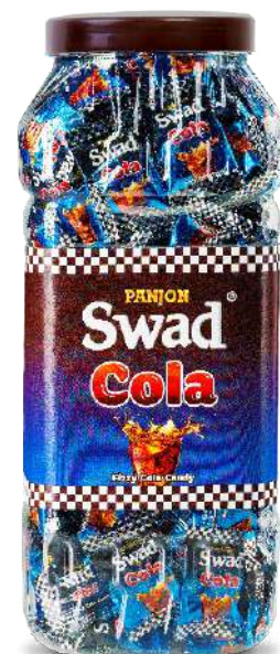
500 gm Jar