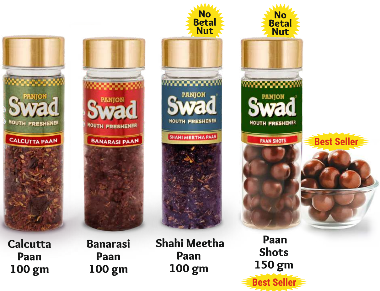
Calcutta Paan 100 gm

India's favourite Paan Leaf based Mukhwas & Paan Shots with 100% Natural ingredients