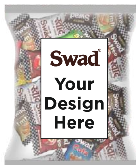
100 gm Plain Pouch