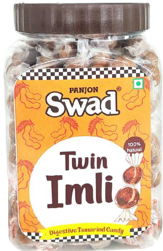
Swad Twin Imli Real Tamarind Twist Candy 380 gm