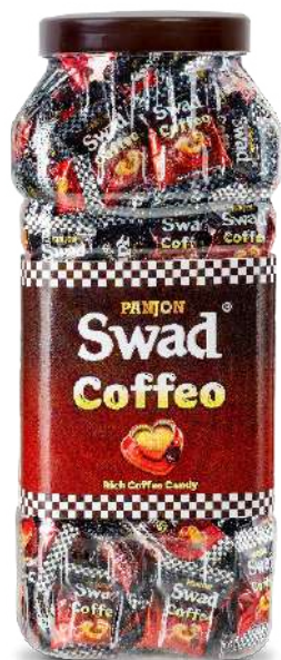
500 gm Jar