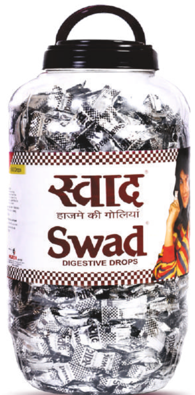
2.5 Kg Jar