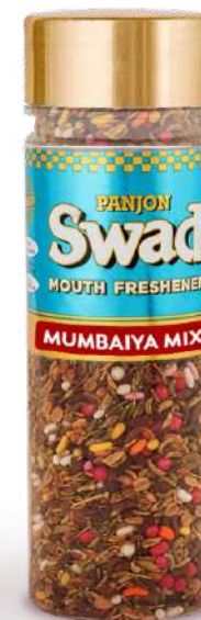
Mumbaiya Mix 130 gm