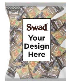
200 gm Pouch