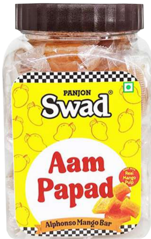
Swad Aam Papad Real Alphonso Mango Slices 380 gm

Hand made Treats with Real Tamarind Pulp & Real Alphonso Mango Pulp