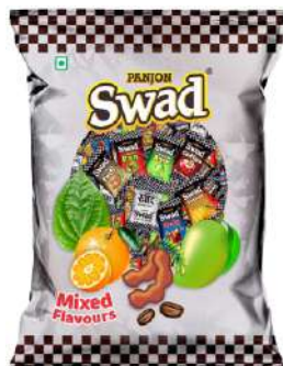
100 gm Pouch

Hard Boiled Candy with Premium Flavours of Raw Mango, Orange, Cola, Tamarind, Pan, Digestive & Coffee