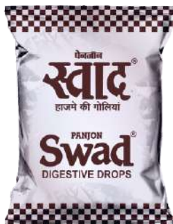
100 gm Pouch

Since 1983 India's Favourite Chatpati Candy with a Spices, Digestive Herbs & Tangy Twist !