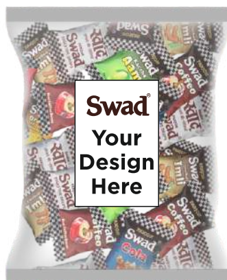
200 gm Plain Pouch