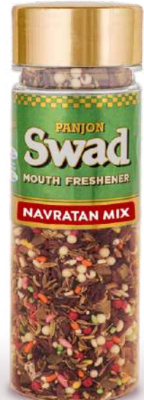
Navratan Mix 140 gm