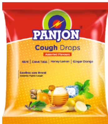
100 g Pouch