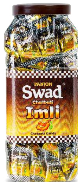
500 gm Jar