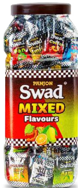
500 gm Jar