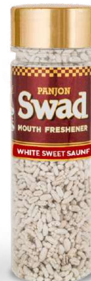
White Sweet Saunf 120 gm