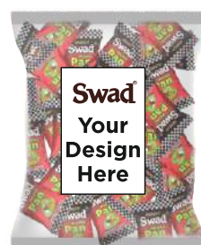
200 gm Pouch