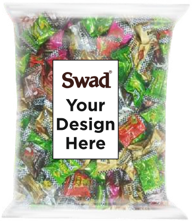
100 gm Plain Pouch

Soft & Pulpy Fruit Chews in 7 flavours : Strawberry, Guava, Tamarind, Raw Mango, Lichi, Pan & Masala