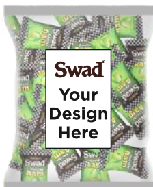
200 gm Pouch