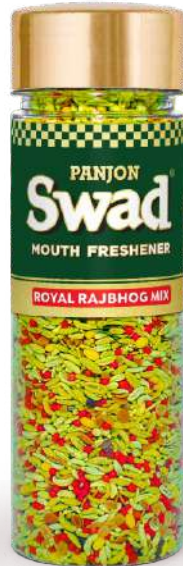
Rajbhog Mix 145 gm