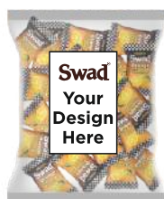
100 gm Plain Pouch