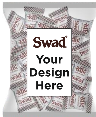
200 gm Plain Pouch