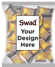
200 gm Pouch