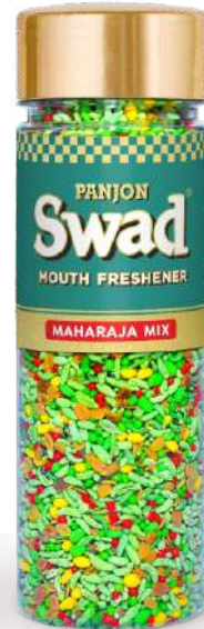
Maharaja Mix 145 gm