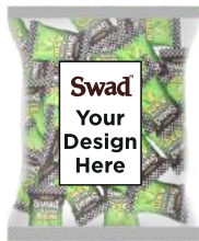
100 gm Plain Pouch