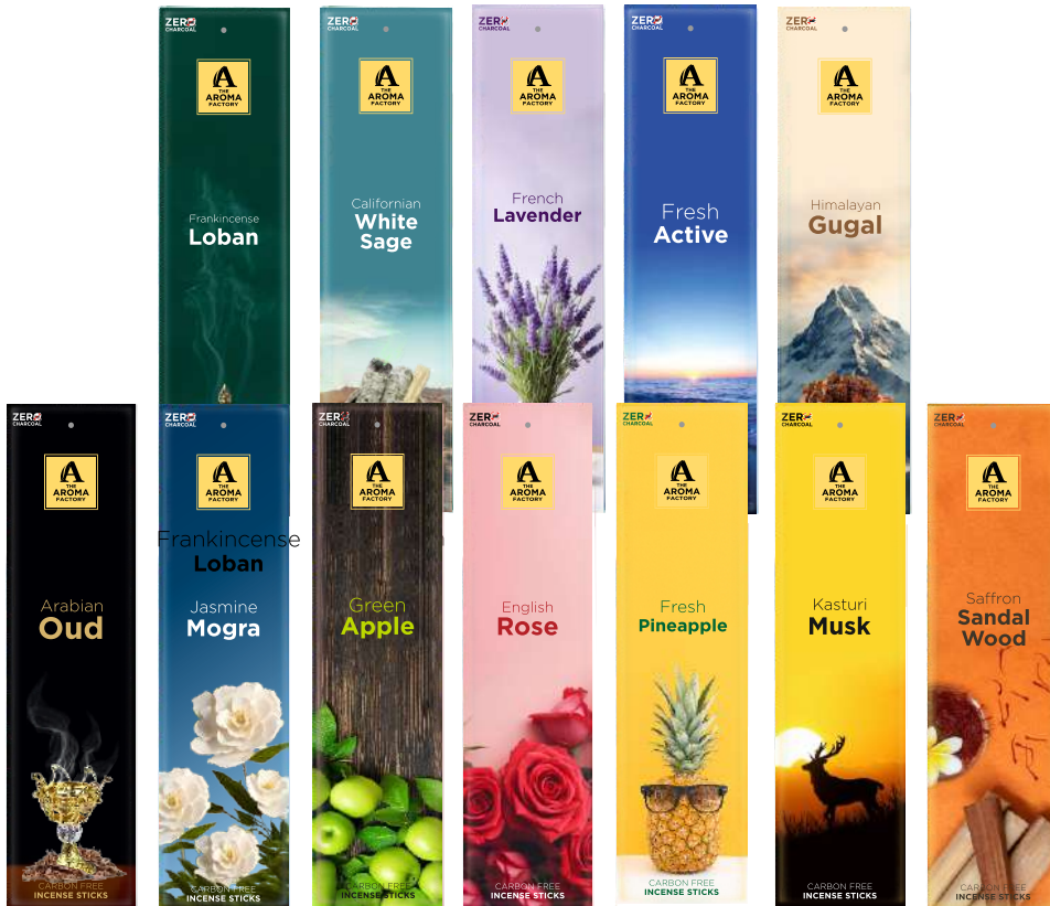
Arabian Oud Jasmine Mogra Green Apple English Rose Fresh Pineapple Kasturi Musk Saffron Sandal Wood