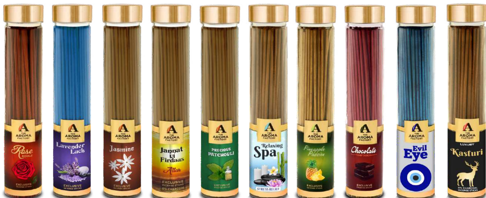
Rose Lavender Jasmine Attar Jannat Patchouli Spa Pineapple Chocolate Evil Eye Musk

1 bottle = 100 gm, 1 carton = 96 bottles 100 gm = (90 sticks approx.)