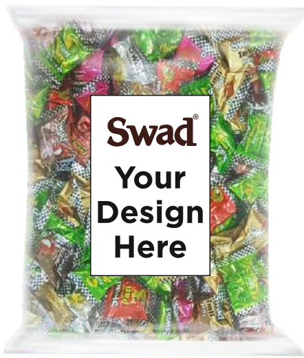
200 gm Pouch