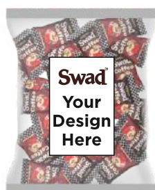
200 gm Pouch