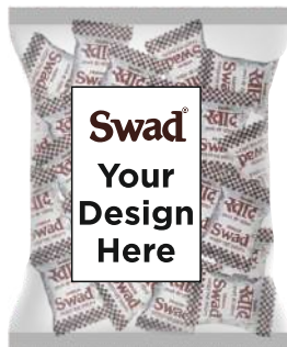
100 gm Plain Pouch