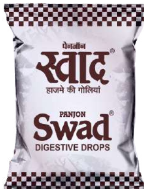
200 gm Pouch