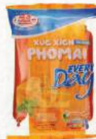
CHEESE RETORT SAUSAGE - EVERYDAY