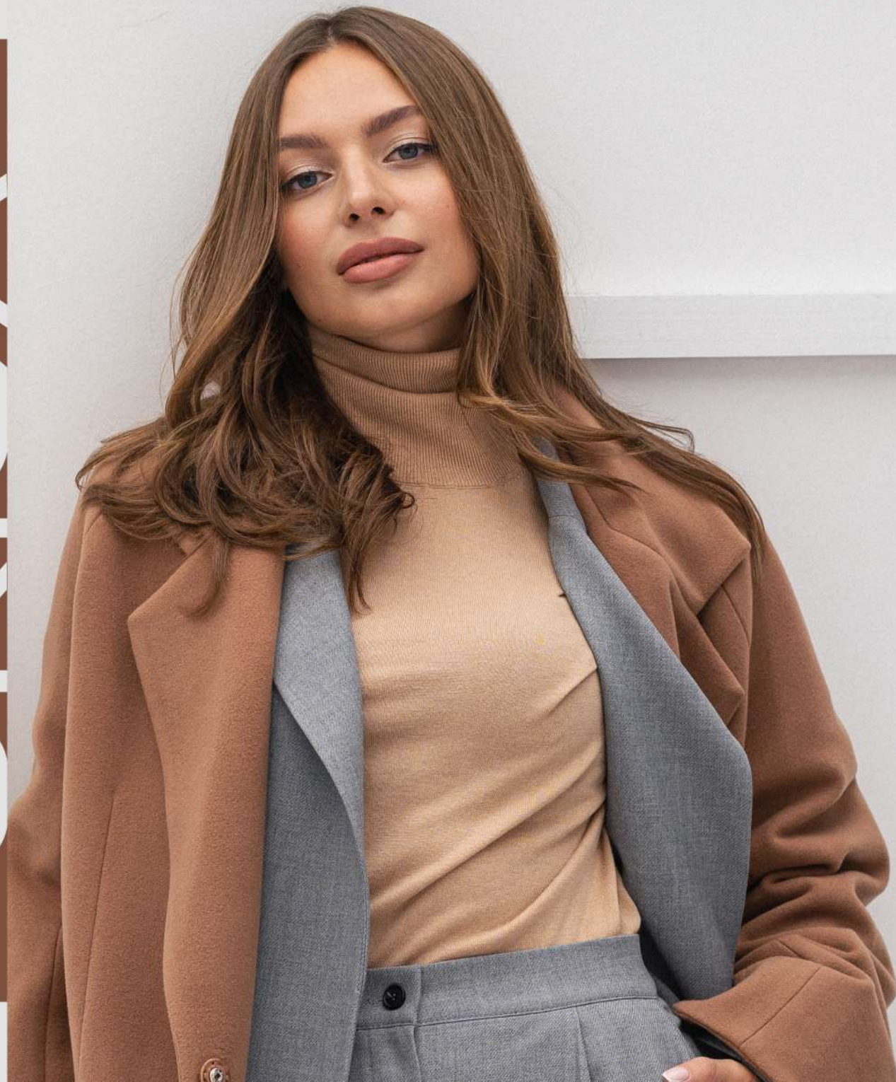
GABRIEL COAT color: Camel