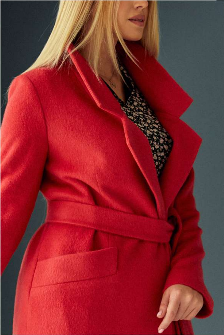
FLORENCE COAT color: Grapefruit