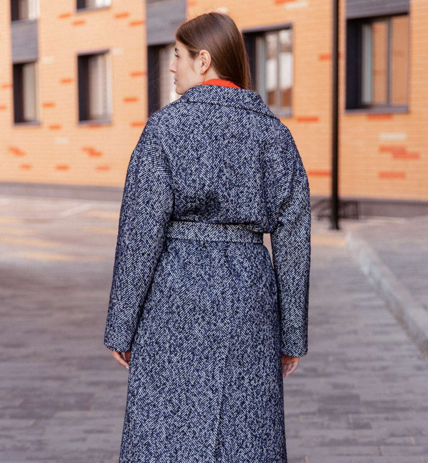
LONDON COAT material: Tweed color: Blue-White-Black