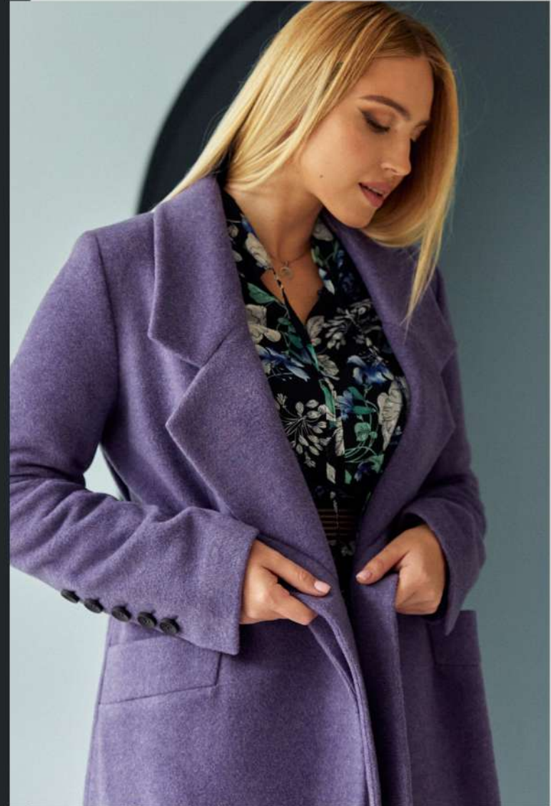
FLORENCE COAT color: Lavender