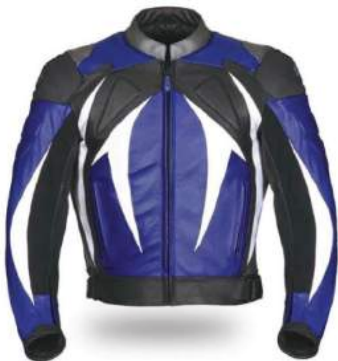
Motorbike Jacket For Men