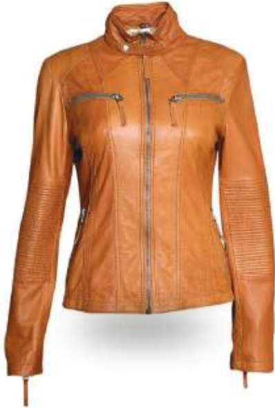
Fashion Jacket For Women