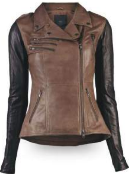
Fashion Jacket For Women