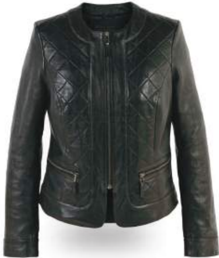
Fashion Jacket For Women