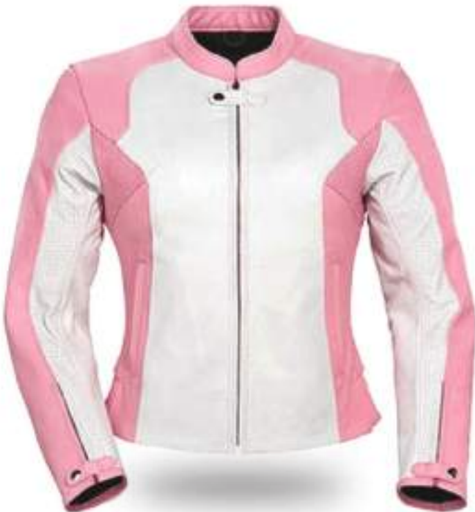
Fashion Jacket For Women