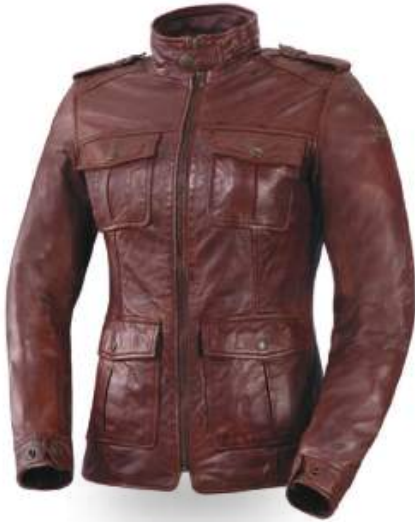
Fashion Jacket For Women