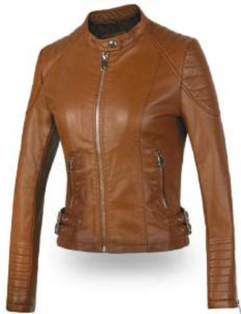
Fashion Jacket For Women