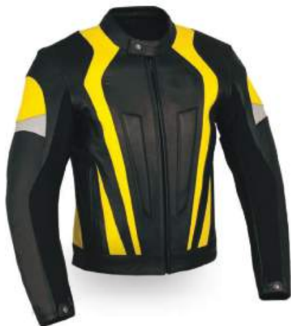
Motorbike Jacket For Men