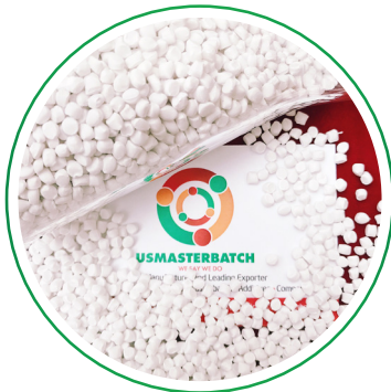
CaCO 3 Filler Masterbatch