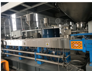
Triple Screw Extruder Lines