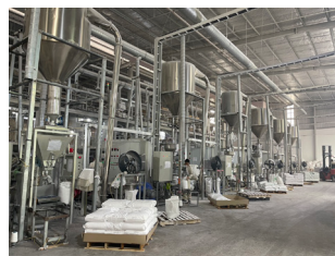
Electronically controlled automatic systems