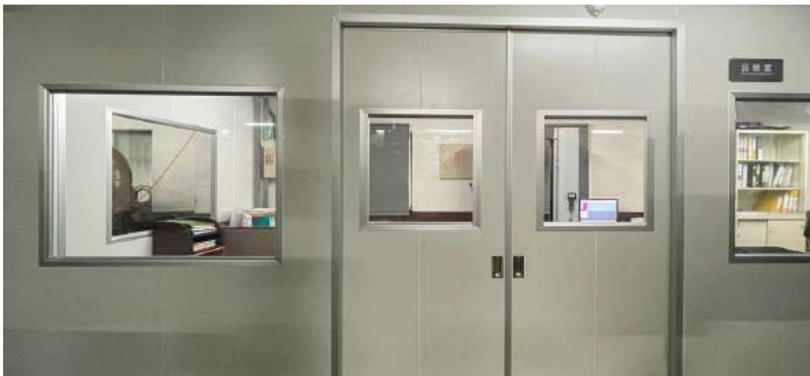
Quality Assurance Room