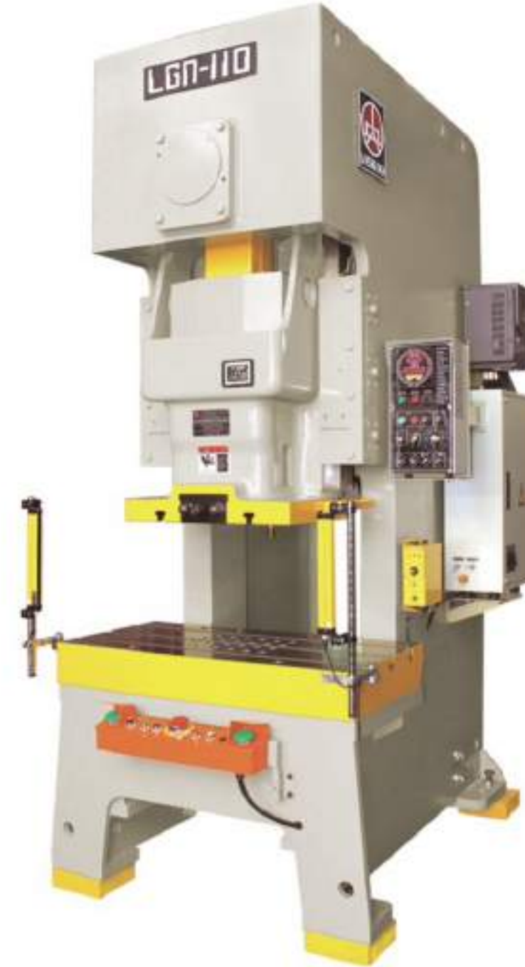
Single Stamping Machine