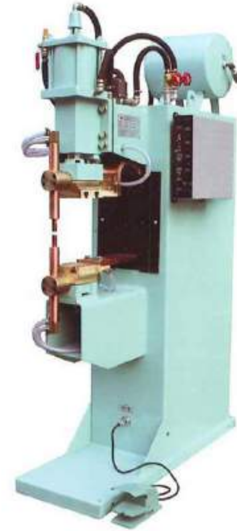
AC Welding Machine