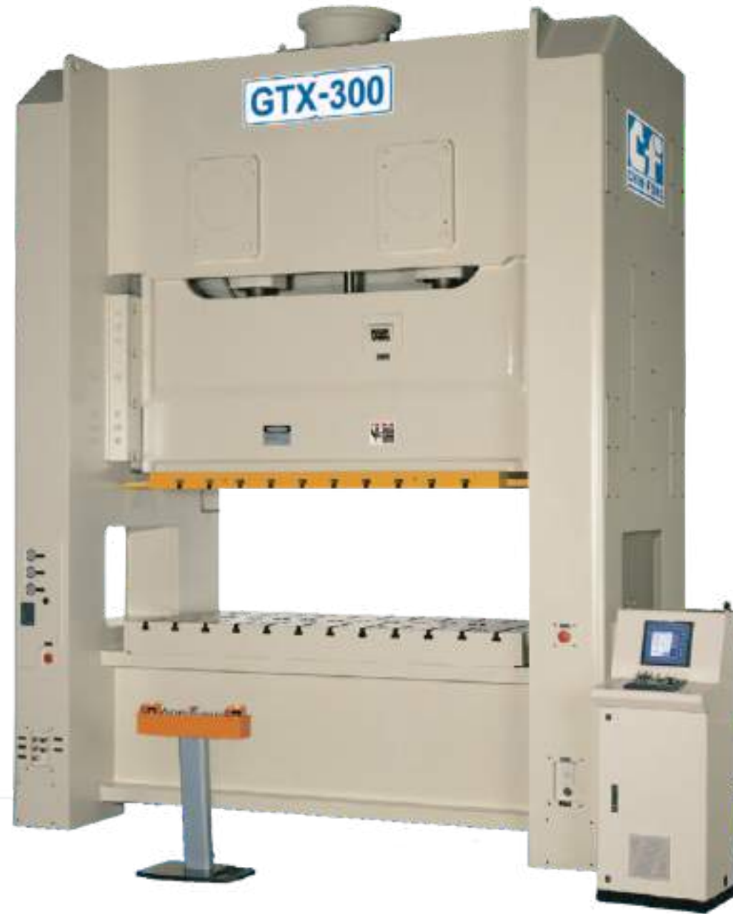
Continuous Stamping Machine