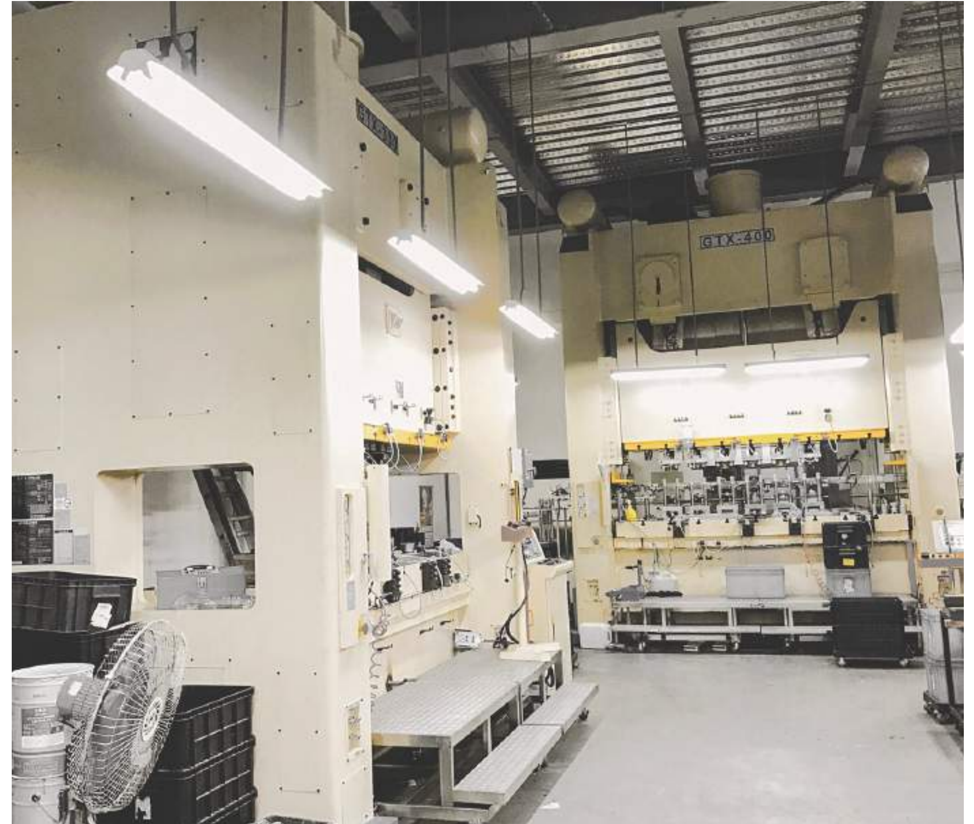
Continuous Stamping Machines (300-400T)