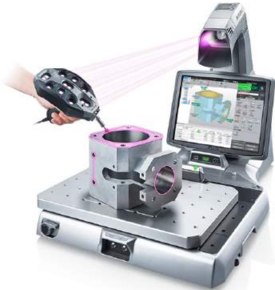
Three-Dimensional Measuring Instrument