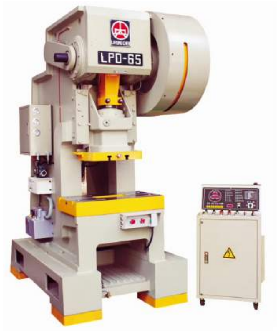
High Speed Stamping Machine