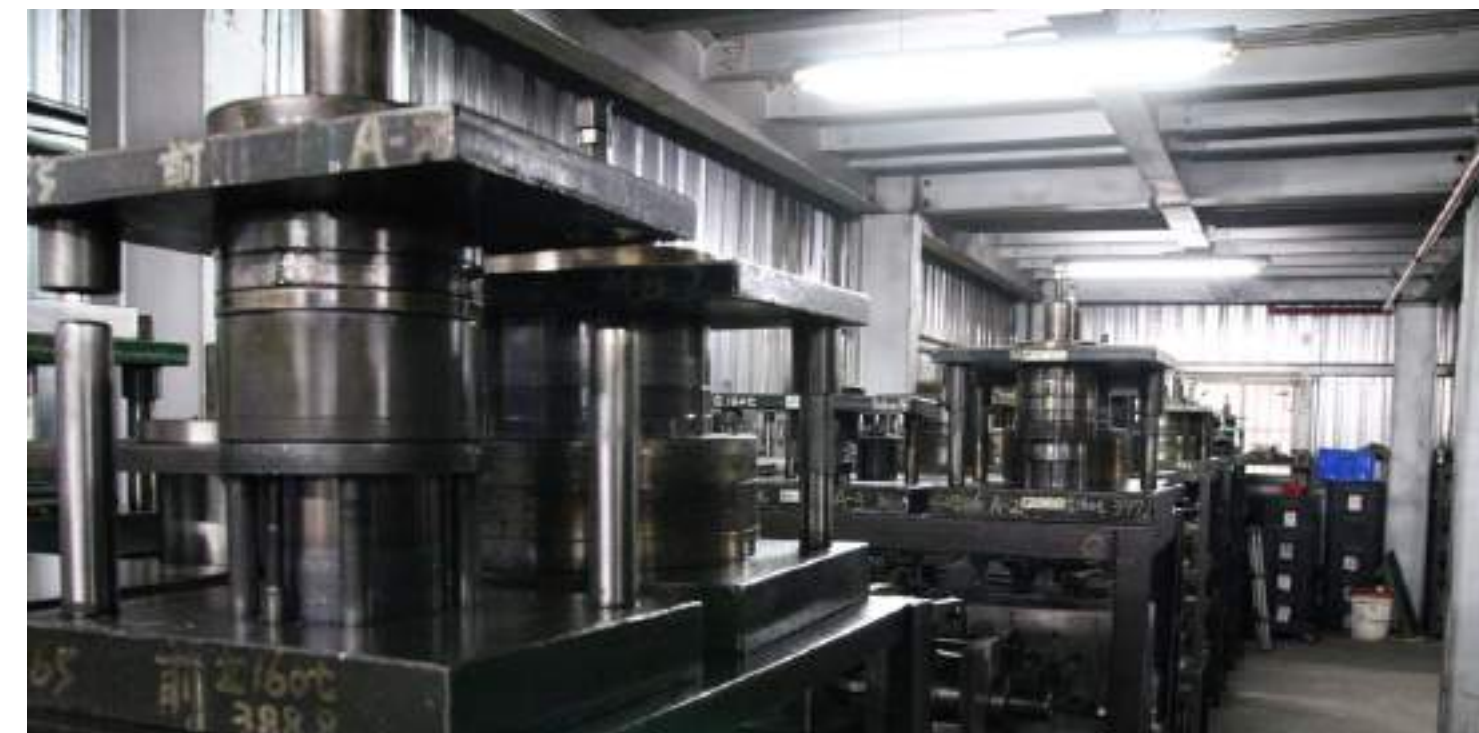
Mold Storage Area