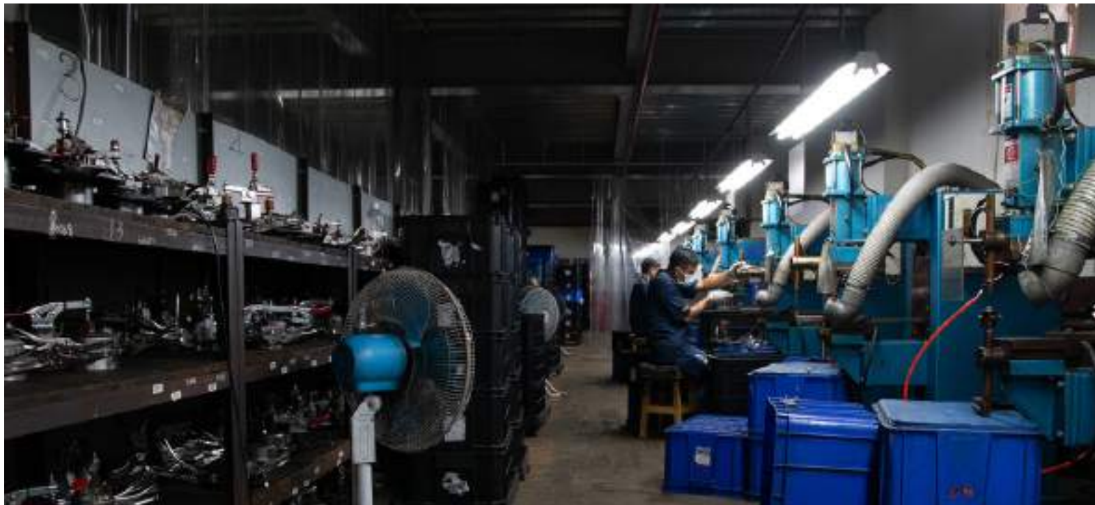
Spot Welding Zone