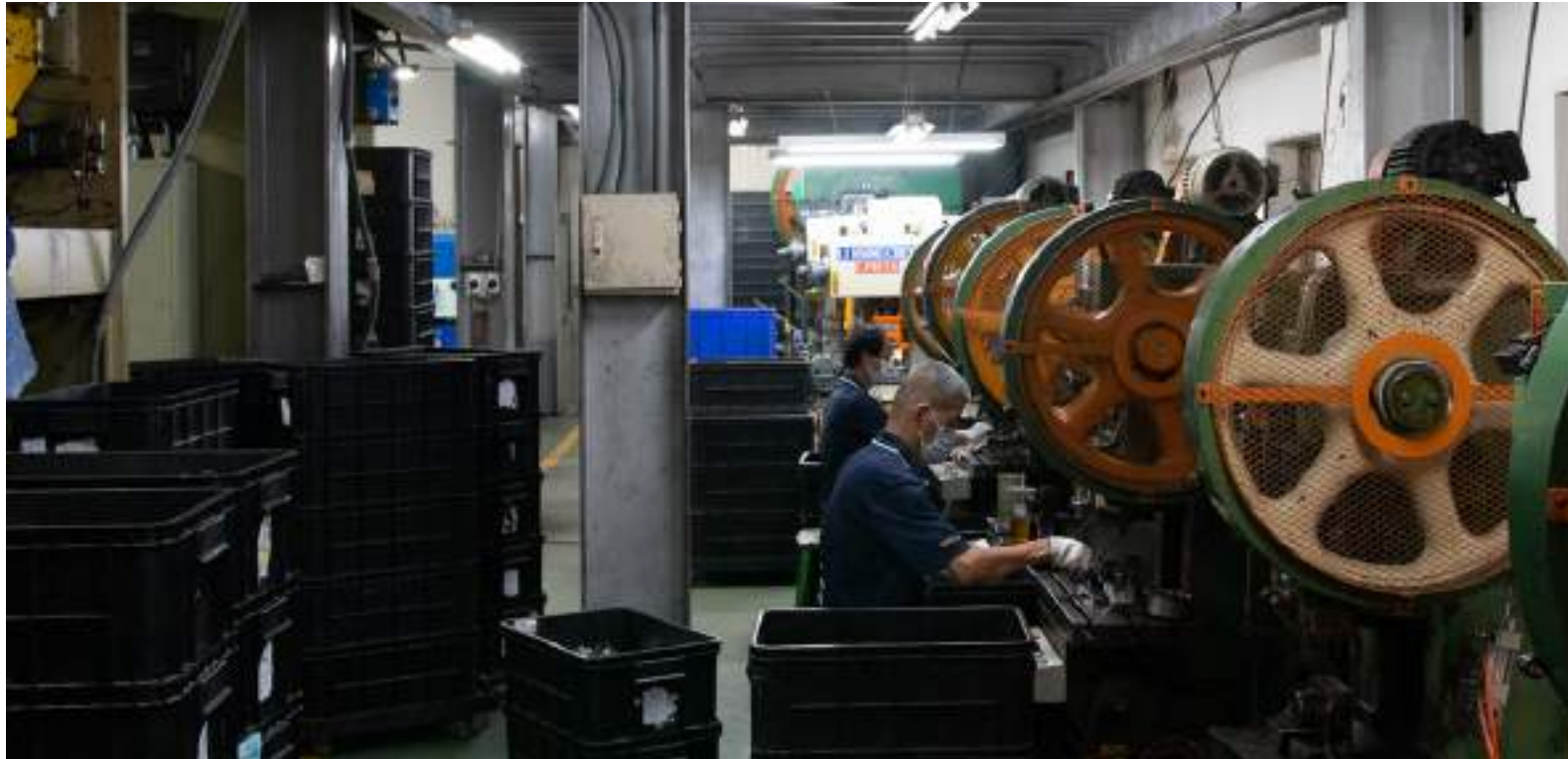
Secondary Stamping Zone