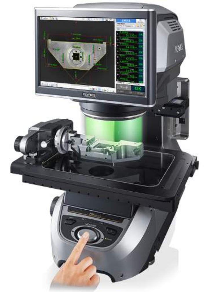
Image Size Measuring Instrument